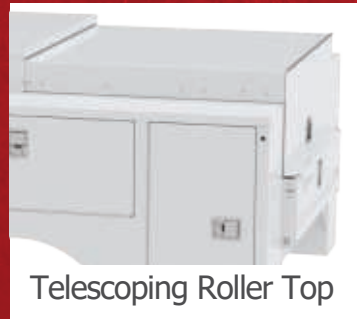
Telescoping Roller Top