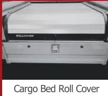
Cargo Bed Roll Cover