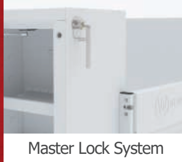
Master Lock System