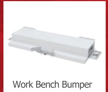
Work Bench Bumper